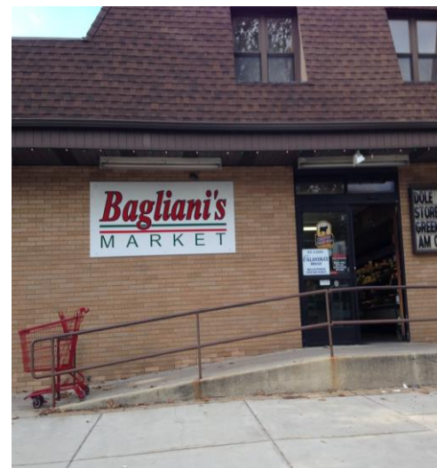
Bagliani's Market on Route 54 in Hammonton, NJ

Hammonton is mostly made up of Italian's. Italian's are crazy about their food. They want everything to be homemade and the best it could possibly be. There are a couple stores that make this possible and convenient. The stores can be found right in the middle of town. Both stores offer fresh meat, homemade side dishes, and more.